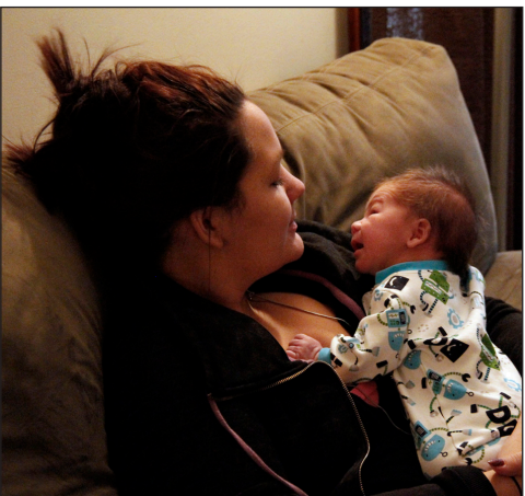
All About Austin: Page B5 By Meagan Pecjak