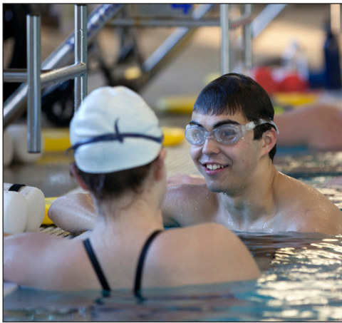
Where Penguins Fly: Page B2 By Rachel Psutka