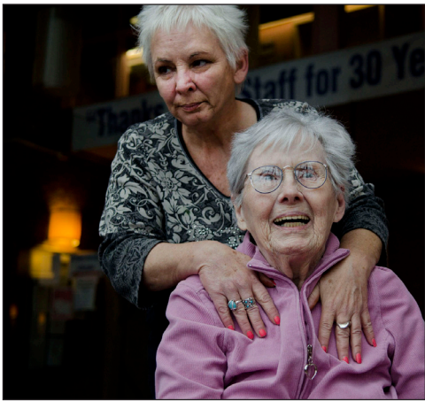
Living In The Past: Page B3 By Samantha Cantelon