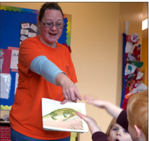
A Sign Of The Times: Page B6 By Amielle Christopherson