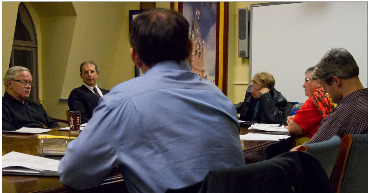
The 2014 Belleville Heritage Committee met Nov. 6 to discuss some ideas for the upcoming year.

“There are days where we all feel frustrations and that, about certain hardships or misgivings. But every day that I’ve been given, I see it as an opportunity to do something, and I do see it as a gift”